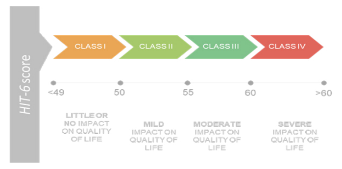
Figure 2: Classes of HIT-6 score

HIT-6 was designed to provide a global measure of adverse headache impact and was developed to use in the screening and monitoring of patients with headaches in both clinical practice and clinical research. The HIT-6 items measure the adverse impact of headache on social functioning, role functioning, vitality, cognitive functioning, and psychological distress. The HIT-6 also measures this verity of headache pain. This validated questionnaire consists of 6 questions, each question or item has the following response options: never (6 points), rarely (8 points), sometimes (10 points), very often (11 points) and always (13 points). Headache impact on this scale range (Table 3) from 36 (no headache) to 78 (very severe headache). All checked points are added for the analysis<sup>[16]</sup>.