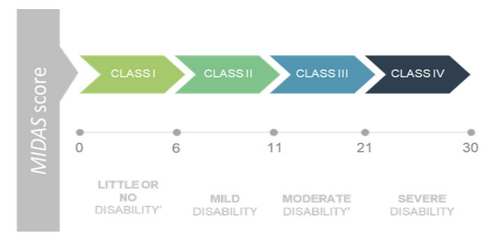
Figure1: Classes of MIDAS score

headache-related disability. It is a short, easy to use questionnaire with 7 items. The first 5 questions assess completely lost days and days with a reduced productivity of at least 50%, which add up to give the MIDAS total score. The frequency and intensity of the headache over the past 3 months are assessed by the last 2 questions. The MIDAS grading system categorises(Table 2) the total score into Class I to IV, from minimal or infrequent disability with a score of 0-5 (Class I) to severe disability with score 21 more (Class IV)<sup>[15]</sup>.